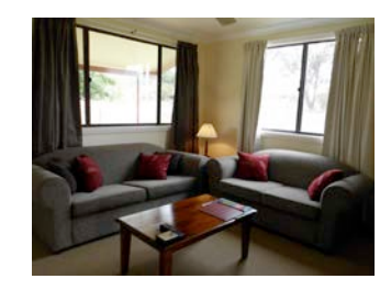
All linen and towels are included, as are your breakfast provisions. Additional requirements can be catered for on request.

Relax in the deep claw foot bath or enjoy a BBQ whilst admiring the spectacular views from your back deck.